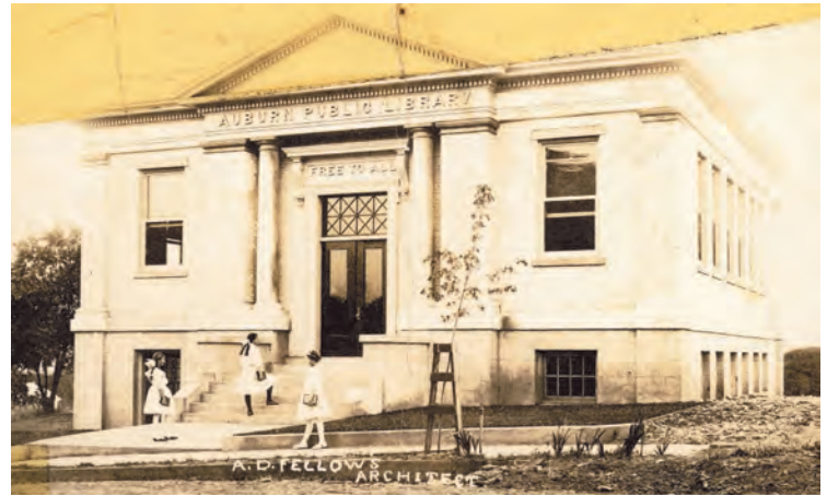
Auburn Public Library, circa 1910 PCM ID#: 1981.68.28

The upper floor of the building housed the city's first