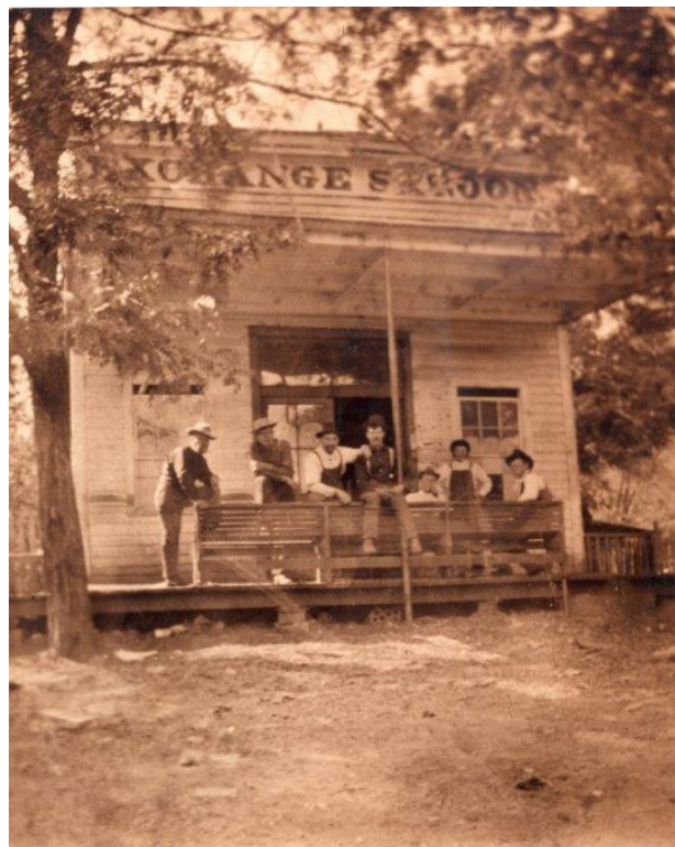
Exchange Saloon in Gold Run