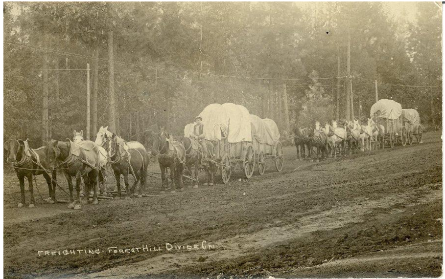
Though we don't have images of freighting on the Sacramento-Auburn Road, we do have a number of freighting photographs from other parts of the county, like this one from Forest Hill.

Though there were plank roads laid in Placer County, I have found no evidence that the Placer County portion of the Sacramento-Auburn road was ever planked. The problem with plank roads was that they decayed fairly rapidly. Boards that weathered away or warped had to be replaced. The constant labor involved in maintaining a good plank road made it cost prohibitive in some areas. Though some plank roads throughout the United States survived to be used by early automobiles, most faded away soon after their popularity peaked in the 1850s.