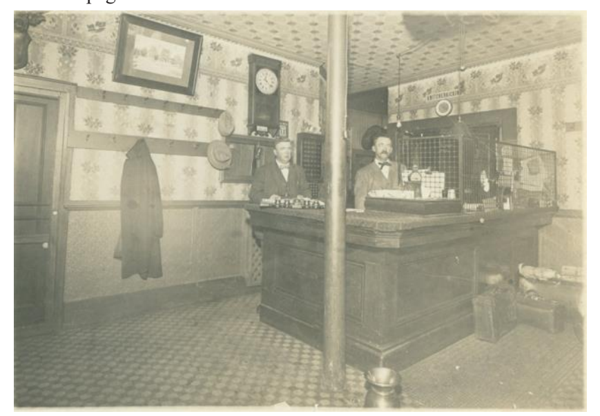
Detail from Official Records Book 475, page 311. Interior of the Freeman Hotel, undated. Are the spittoon and wall clock the same ones listed in the 1946 inventory of the lobby?