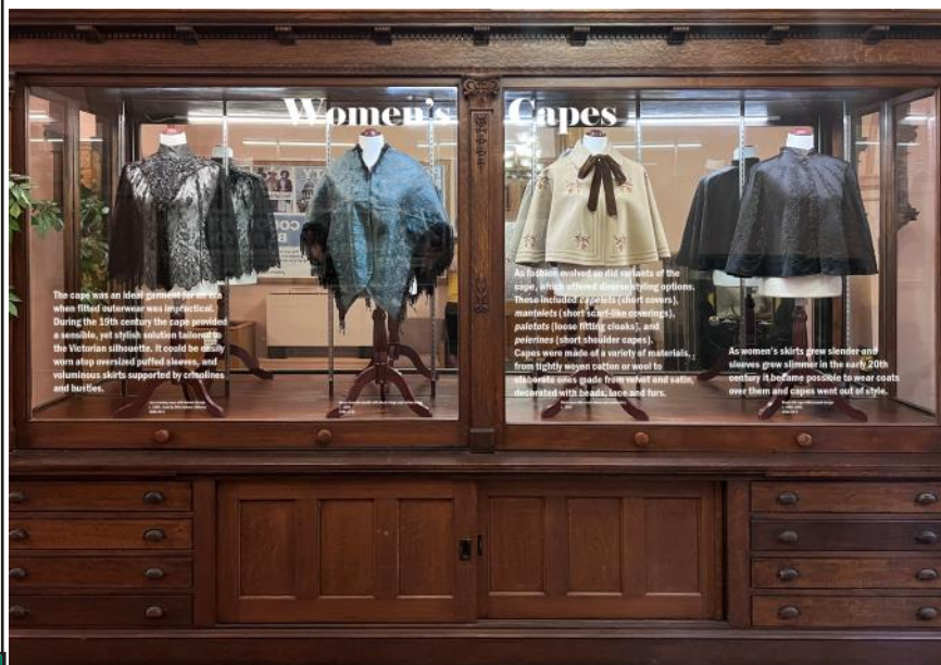
A new exhibit at the historic courthouse in Auburn showcases women's capes from the Placer County Museums collection.

For a full and updated schedule for this summer's Heritage Trail, please visit: www.placer.ca.gov/heritagetrail . I hope to see you all somewhere on the Heritage Trail this summer!