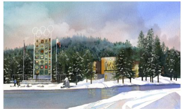
Conceptual Rendering Sierra Valley Ski History Museum August 17, 2018

Visit Our Interim Location: Until the new museum opens, explore artifacts and memorabilia from the 1960 Olympics and learn about Sierra ski pioneers at our current location in the Boatworks Mall, Tahoe City.