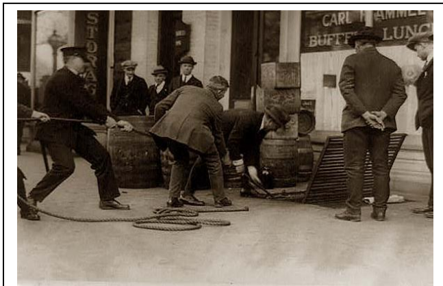
Police Raid in Washington DC in 1923