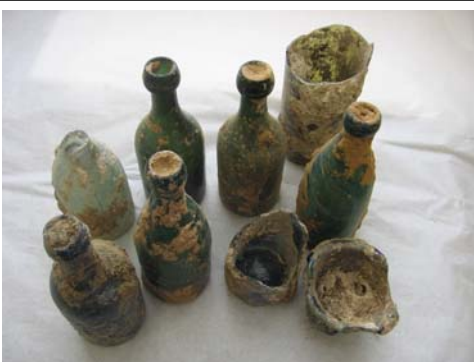
Bottles from the Courthouse Parking Lot

So how does all this tie into Prohibition and Repeal? Beer and other alcoholic beverages were the mainstay of most bottling companies in the early 20 th century. Many breweries such as Buffalo stopped making beer in 1920 because of the Volstead Act, better known as Prohibition. They produced non-alcoholic beverages such as near-beer with some success. After Repeal in 1933, some of these small breweries like Buffalo were unable to recapture their lost sales and eventually closed. If you have a bottle story with ties to Placer County, let me know. It could make an interesting addition to any exhibit we plan.♣