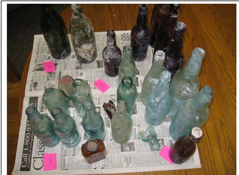
Bottles Found during the Streetscape Project

Their books will be for sale before and after the program.♥