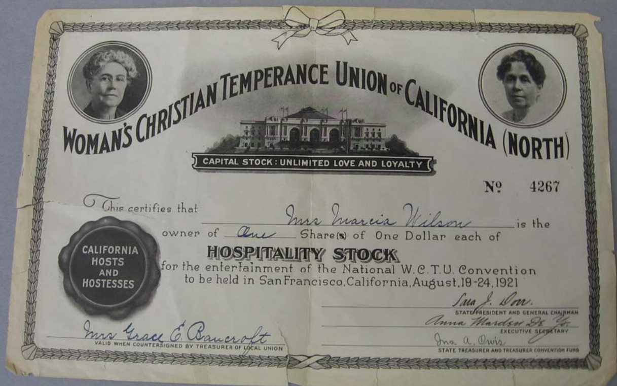
Hospitality Stock Certificate (1921)