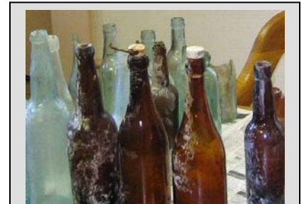
Bottles found during Phase One of the Streetscape Project.

Some of the bottles were dug up from Central Square during Streetscape Phase one. With another eight phases to go in this $12 to $20 million redevelopment project, it will be interesting to see what happens.