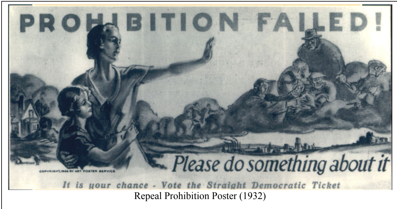
Repeal Prohibition Poster (1932)